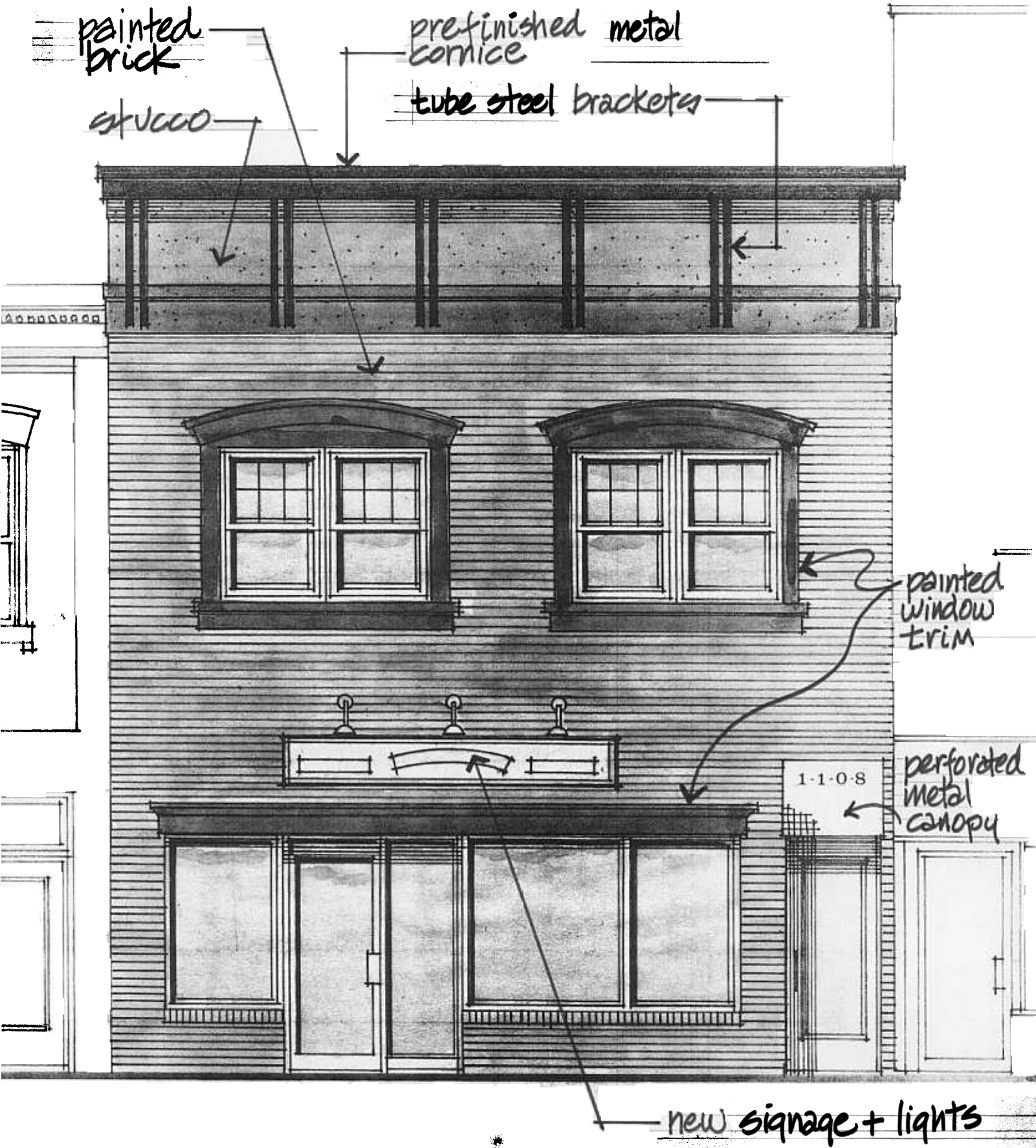
EXTERIOR FINISH 1108 WASHINGTON AVENUE GOLDEN, COLORADO